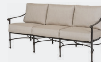
SOFA MORRO BAY FRAME: 10320023 MORRO BAY II FRAME: 1032PB23* CUSHION: GCMB00SF W:71.5 D:32.5 H:34.5 SH:20.5 AH:24.5