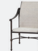
DINING CHAIR SLING: 50320001 PADDED SLING: 60320001 W:24.5 D:29.5 H:37 SH:17.5/19.5 AH:25.5