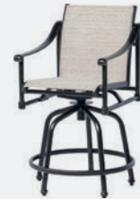
SWIVEL ROCKING BALCONY STOOL SLING: 50320036 PADDED SLING: 60320036 W:24.5 D:25 H:41.5 SH:25.5/27.5 AH:31.5