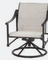
SWIVEL ROCKING LOUNGE CHAIR SLING: 50320024 PADDED SLING: 60320024 W:28 D:30 H:35.5 SH:17/19 AH:24.5