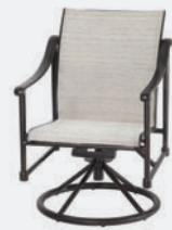
SWIVEL ROCKER SLING: 50320011 PADDED SLING: 60320011 W:24.5 D:29.5 H:37 SH:17.5/19.5 AH:25.5