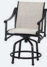
SWIVEL BALCONY STOOL SLING: 50320006 PADDED SLING: 60320006 W:22 D:25 H:41.5 SH:25.5/27.5 AH:31.5