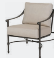
LOUNGE CHAIR MORRO BAY FRAME: 10320021 MORRO BAY II FRAME: 1032PB21* CUSHION: GCMB00LC W:27 D:32.5 H:34.5 SH:20.5 AH:24.5