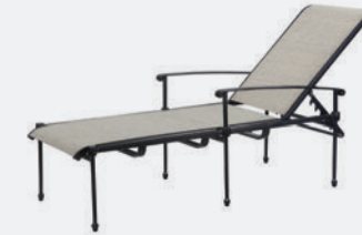
CHAISE LOUNGE SLING: 50320009 PADDED SLING: 60320009 W:27 D:81 H:48 SH:16/18 AH:24