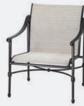
LOUNGE CHAIR SLING: 50320021 PADDED SLING: 60320021 W:28 D:30 H:35.5 SH:17/19 AH:24.5