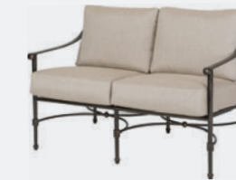
LOVESEAT MORRO BAY FRAME: 10320022 MORRO BAY II FRAME: 1032PB22* CUSHION: GCMB00LS W:49 D:32.5 H:34.5 SH:20.5 AH:24.5