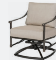
SWIVEL ROCKING LOUNGE CHAIR MORRO BAY FRAME: 10320024 MORRO BAY II FRAME: 1032PB24* CUSHION: GCMB00LC W:27 D:32.5 H:34.5 SH:20.5 AH:24.5