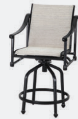
SWIVEL BAR STOOL SLING: 50320007 PADDED SLING: 60320007 W:22 D:25 H:46 SH:30.5/32.5 AH:36.5