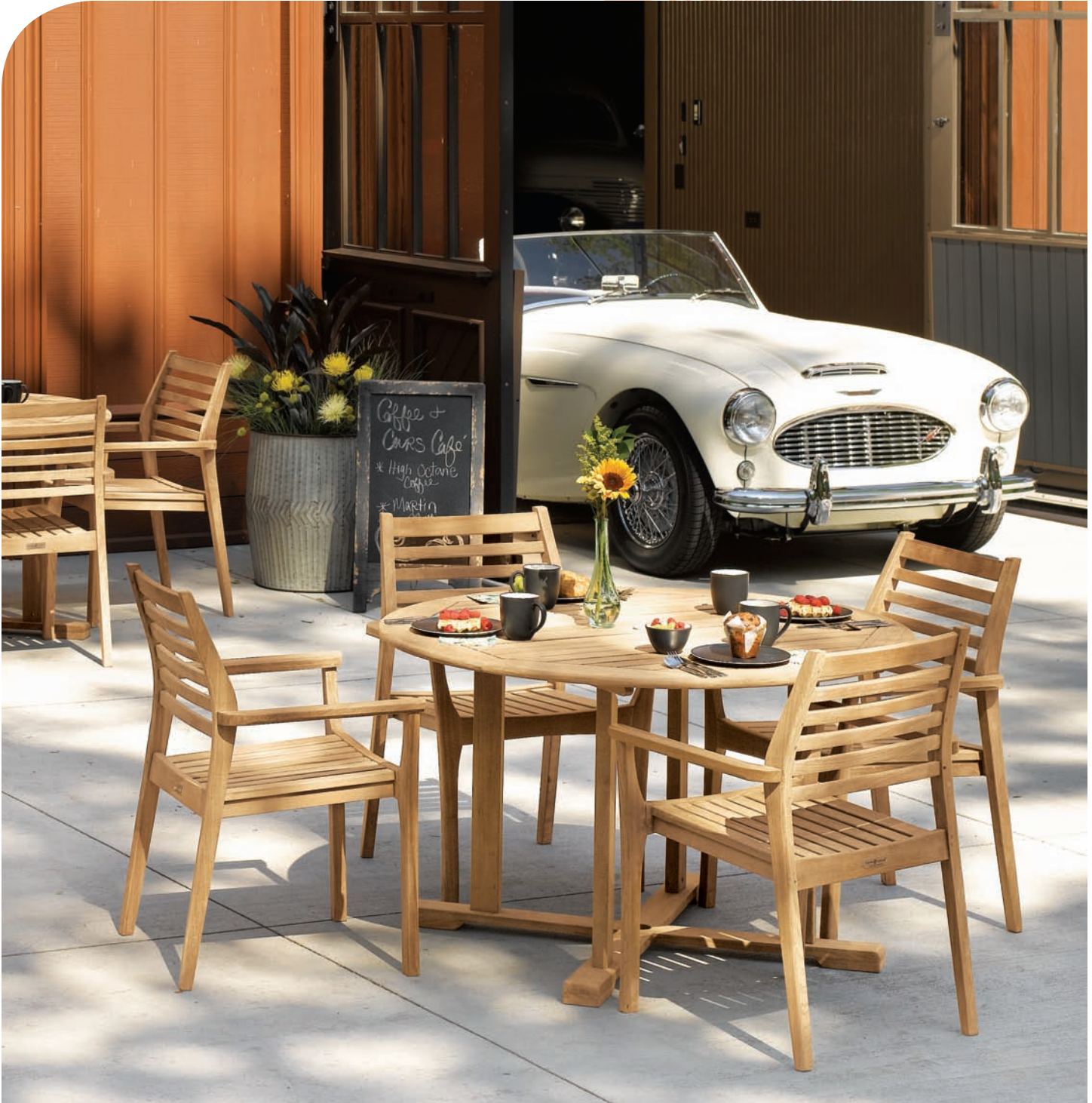
ABOVE: Mera Stacking Armchairs with 48" Oxford Round Dining Table. RIGHT: Mera Stacking Armchair.