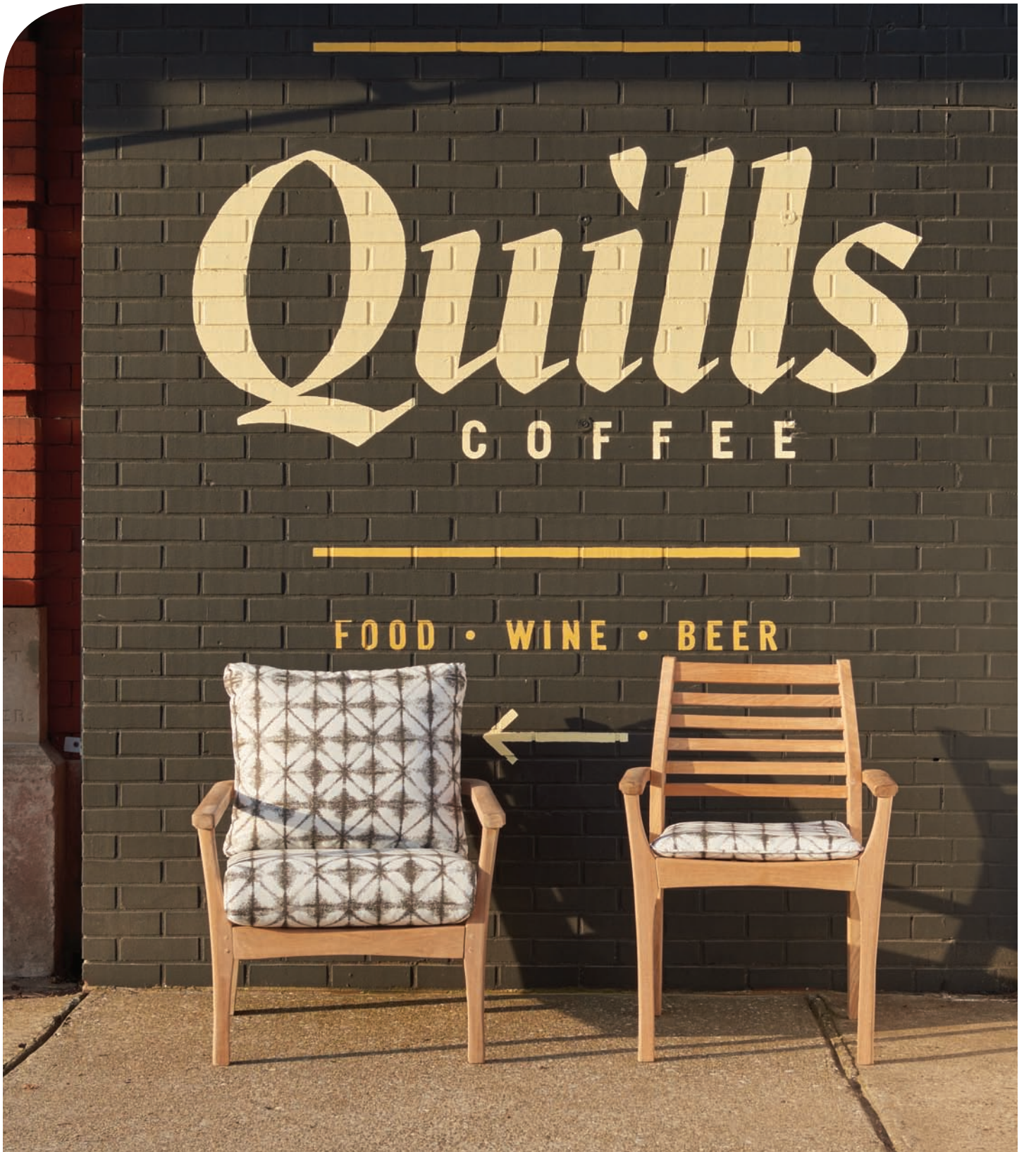
ABOVE: Mera Club Chair and Arm Chair with Cushions in Sunbrella® Performance Fabric. TOP RIGHT: Mera Loveseat and Club Chairs with Cushions in Sunbrella® Performance Fabric and Eiland Occasional Tables. BOTTOM RIGHT: Mera Club Chairs with Cushions in Peridot Solution-Dyed Polyester and Siena Side Table.

DETAILS: MERA PAGE 86, EILAND PAGE 77, SIENA PAGE 87, FABRIC PAGES 97-98