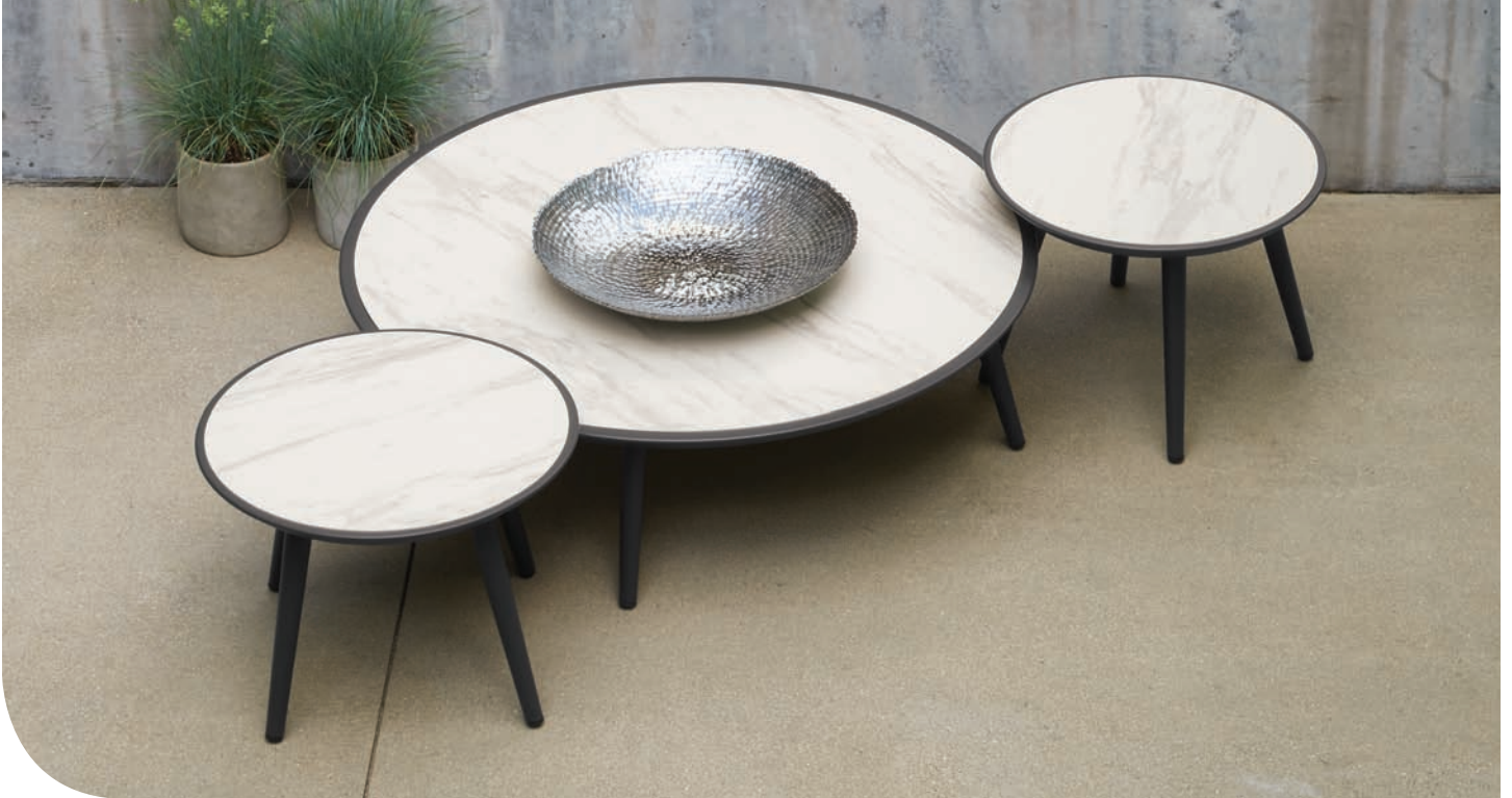
ABOVE TOP: Nette Sofa with Cushions in Sunbrella® Performance Fabric. ABOVE BOTTOM: Nette Occasional Tables. TOP RIGHT: Nette Sofa and Club Chairs with Cushions in Tangerine Olefin and Nette Occasional Tables. BOTTOM RIGHT: Nette Club Chair with Cushions in Seafoam Olefin.

DETAILS: NETTE PAGE 72, FABRIC PAGES 97-98