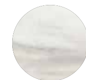
Porcelain Ceramic Bianco

*Dual-Layer Olefin Strap Arm Chair comes with a Ninja sling seat.