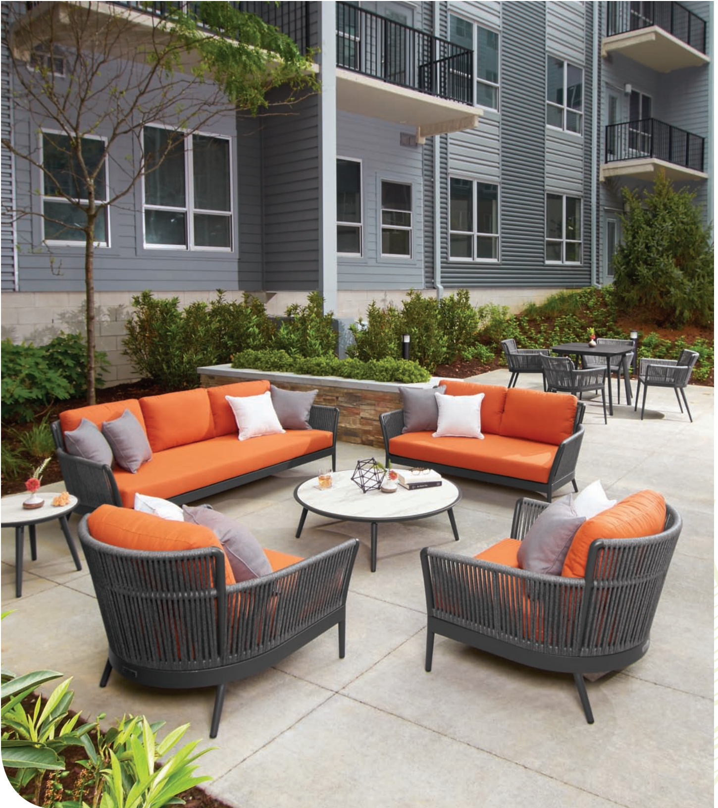
ABOVE TOP: Nette Sofa (New), Loveseat (New), and Club Chairs (New) with Cushions in Sunbrella® Performance Fabric and Nette Occasional Tables (New). Nette Armchairs and Eiland 36" Dining Table. TOP RIGHT: Nette Loveseat and Club Chair with Cushions in Seafoam Olefin, 20" Lumbar Pillows in Salt Olefin (New), and Nette Occasional Tables. BOTTOM RIGHT: Nette Loveseat with Cushions in Sunbrella® Performance Fabric.

DETAILS: NETTE PAGE 72, EILAND PAGE 77, FABRIC PAGE 97-98