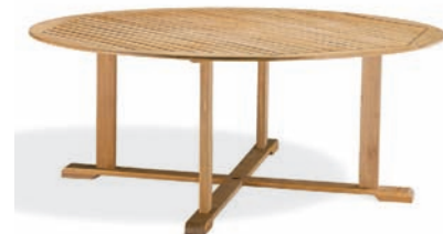
RD67TA (Shorea) RD67TAK (Teak) 67" Round dining table (seats 6) diameter 67" height 29" 124 lbs. assembled - no umbrella hole