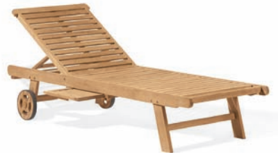
L7O (Shorea) L7OK (Teak) Chaise lounge Cushion available* width 25.5" depth 78.75" height 34.5" seat height 15" 76 lbs. assembled