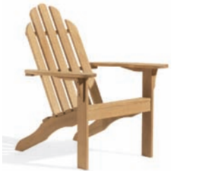
ADCH (Shorea) ADCHK (Teak) Chair Cushion available* width 31" depth 35.5" height 38" seat height 16" 51 lbs. assembled