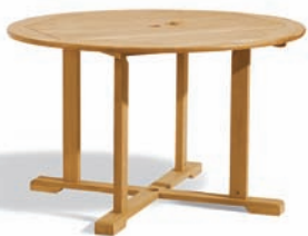
RD48TA (Shorea) RD48TAK (Teak) 48" Round dining table (seats 4) diameter 47.25" height 29" 75 lbs. assembled - includes 2" (50mm) umbrella hole and plug