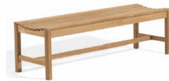
BB6O (Shorea) BB6OK (Teak) 5' Backless bench Cushion available* width 59.5" depth 18.75" height 17.5" seat height 17.5" 64 lbs. assembled