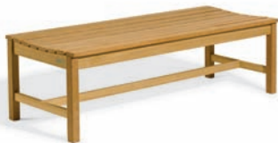
BB48 (Shorea) BB48K (Teak) 4' Backless bench Cushion available* width 48.5" depth 18.75" height 17.25" seat height 17.5" 44 lbs. assembled

DINING TABLES have slatted tops to prevent ponding and wood-to-wood leg joinery for stability. Pair with seating from Classic, Mera, or Wexford Collections.