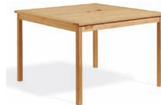
CD42TA (Shorea) CD42TAK (Teak) 42" Square dining table (seats 4) width 42.25" depth 42.25" height 29.25" 65 lbs. assembled - includes 2" (50mm) umbrella hole and plug