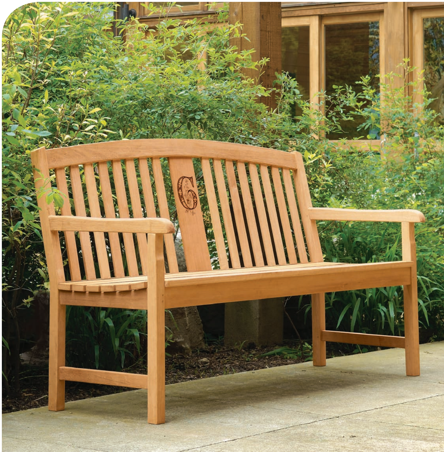
ABOVE: 5' Laser Engraved Signature Bench. RIGHT: 5' Laser Engraved Signature Bench and 19" Planters.

Signature benches make a great memorial or corporate-branded bench. The back is tailored to accept a wide panel for customized, precise laser engraving.